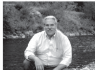
Proprietor of Java John's Espresso