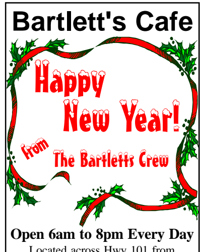
Located across Hwy 101 from The Downtown Fun Zone in Port Orford

The public is invited to an impromptu sing (performance and sing-along) by the youth and young adults of North Curry County on Friday, December 28, at the Savoy Theater, from 4:30 to 5:30pm. The North Curry County churches sponsor the Season of Giving Sing.