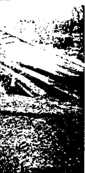
The ladder sticking up from necessary for workers to