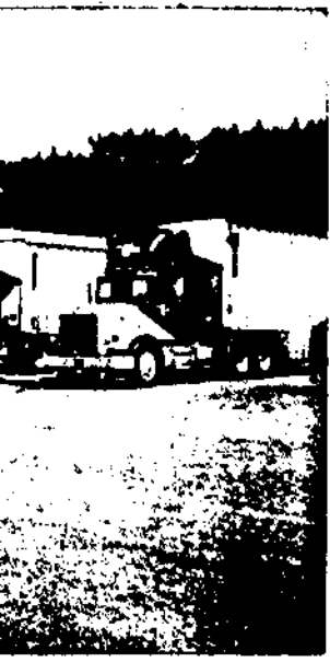
Trucks line up and wait in the