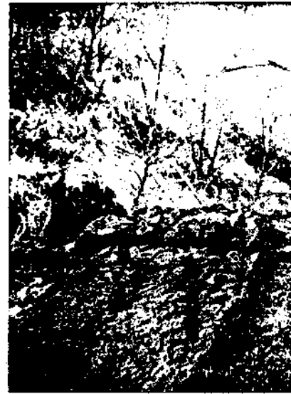
View from the northbound lanes. The shallowest part of the break was scale this newly created cliff.