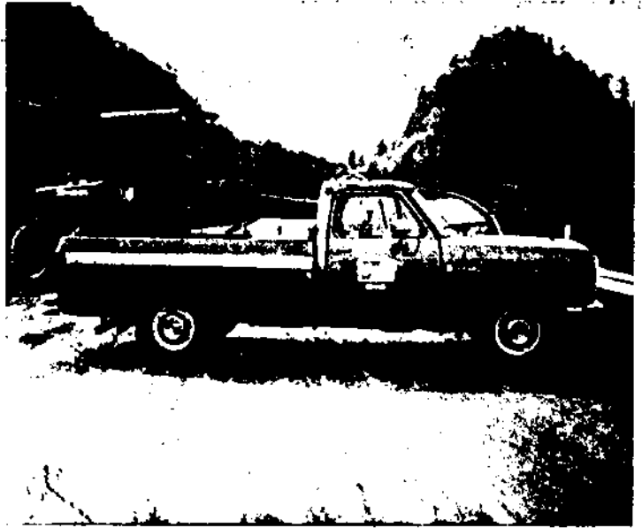
No thru traffic! Road crew vehicles block any approach to the actual site of the highway slide.