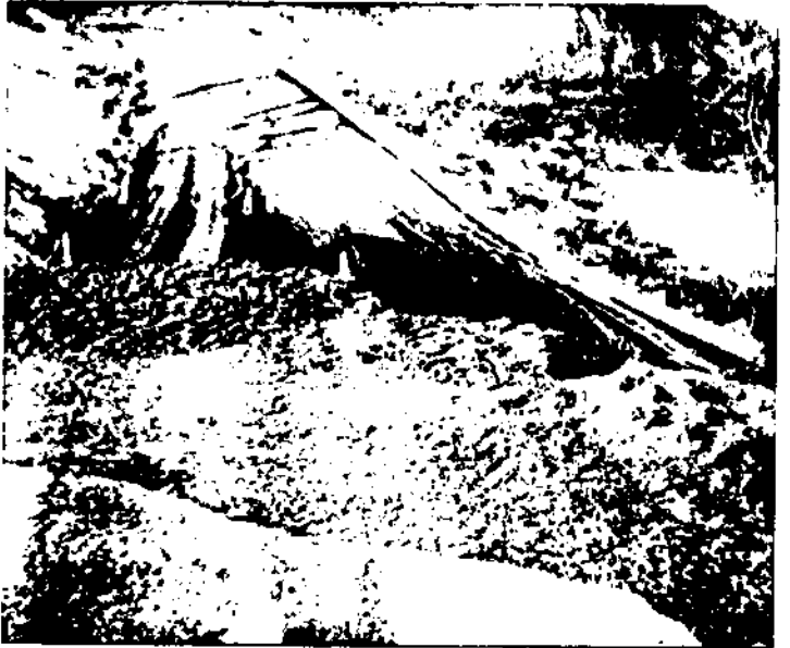
Although this photo, taken facing south, doesn't show it well, there is a 10-20 foot drop (more in the southbound lanes than in the northbound). Additional cracks can be seen further south.