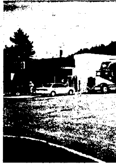
Like horses in a corral, big-rig trucks are packed in the Circle K parking lot.